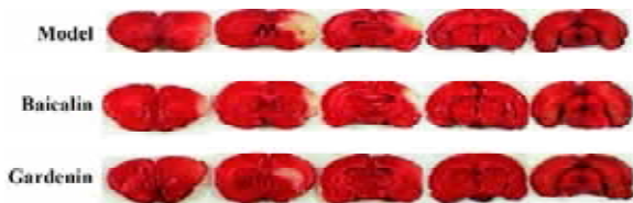
Figure 1. Cross-sections showing cerebral infarction areas (in white) of a number of samples stained with 2,3,5-triphenyltetrazolium chloride.

TTC staining Both baicalin and gardenin reduced the infarction areas in cerebral ischemia rats by 6%–7% compared with the model group. The ratio of differences was tested using the Student t -test (Figure 1, Table 1).